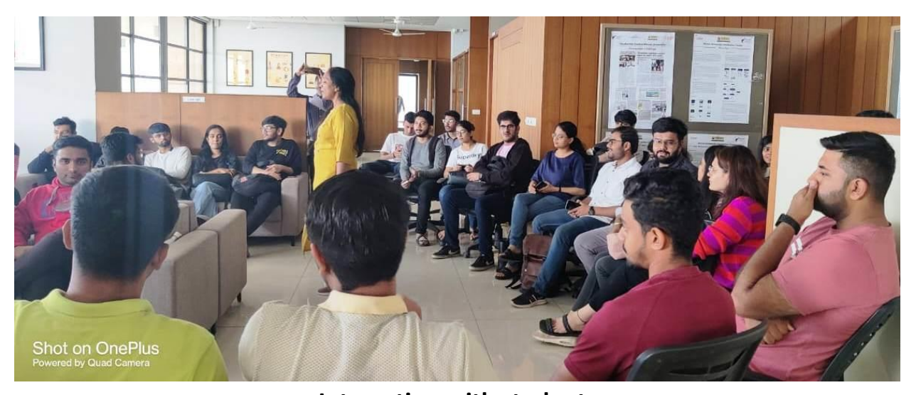
Interaction with students